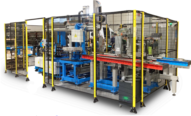
Sample of a TQM Automatic Line